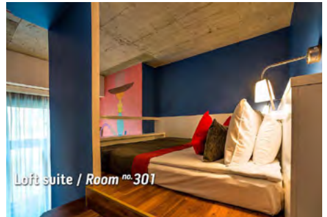
Bohem Art Hotel